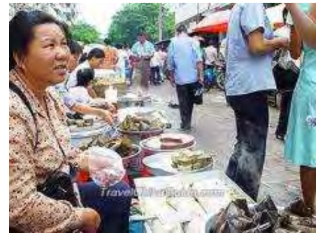
Zongzi Sold in the Local Markets

To protect his body from becoming fish's dinner, people fed the water creatures with Zongzi. Since then, eating Zongzi has been kept as one of the most important Dragon Boat Festival traditions. Wormwood and calamus are also hung on the windows and doors to avoid diseases and bad luck. Children wear coloured silk with red, yellow, blue, white and black on their ankles and wrists to ward off evil and diseases.