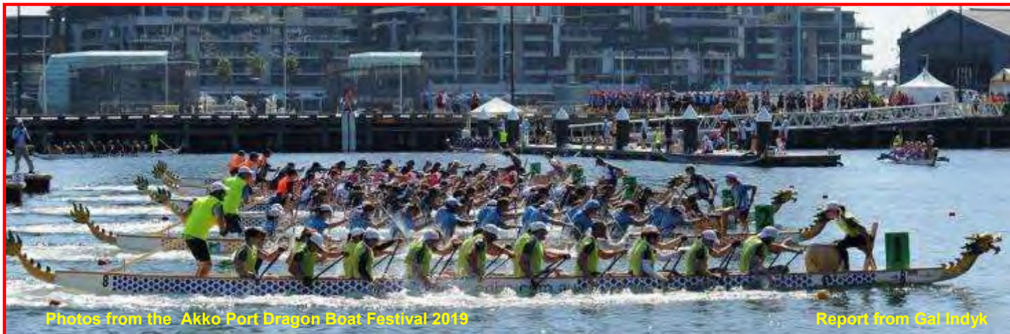
Photos from the Akko Port Dragon Boat Festival 2019