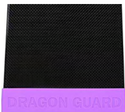
Dragon Boat Paddle Tip Protector

DIYthinker Logo Taiwan or China Dragon Boat Race Environmentally Washable Shopping Tote Canvas Bag Craft Gift