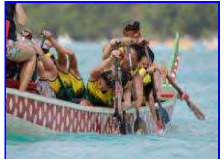
(Right) FEELING THE BURN . Members from a team from Hong Kong power through the Matapang Beach waters at the Festival.